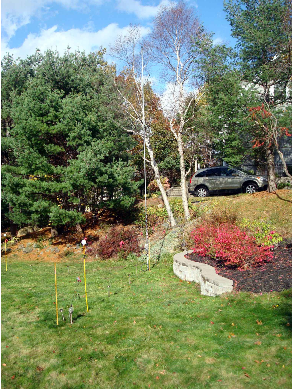
You can see some of the solar lights I placed under the wires and on the mast to indicate a hazard presence at night. My neighbours thought it quite artful.